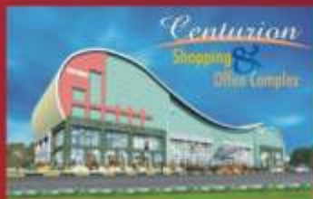
NERUL (E) PLOT NO. : 88 - 91, SECTOR - 19A