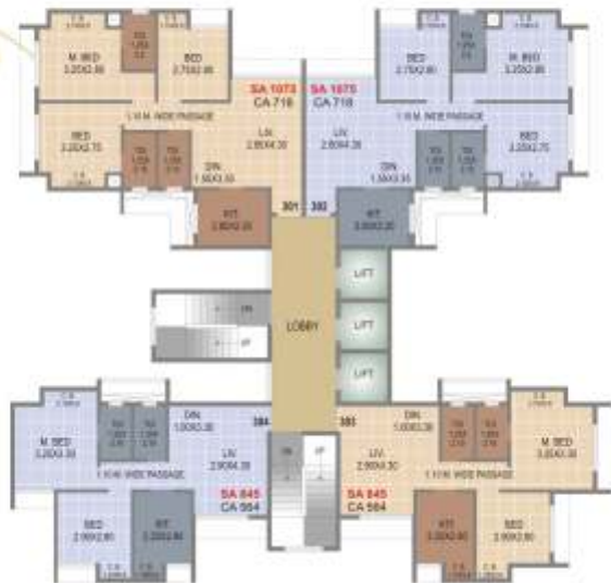
TYPICAL FLOOR PLAN FOR BLDG. NO. 17 & 18 (TYPE E)