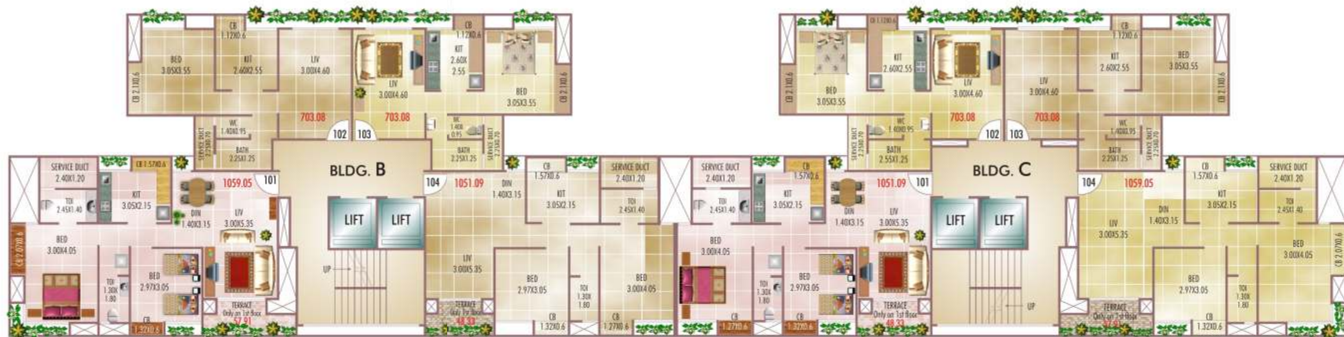
804 & 1304 (Refuge Area)

(1st to 7th & 9th to 12, 14th & 15th Floors)